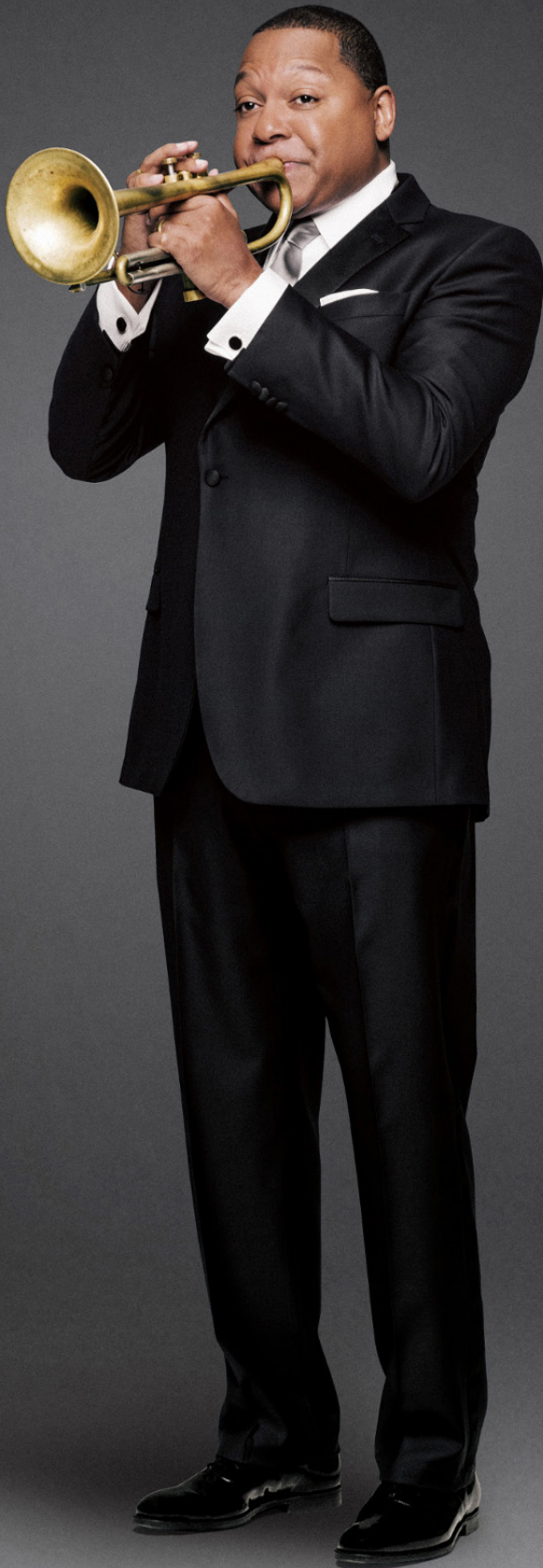
Wynton Marsalis, Jazz at Lincoln Center