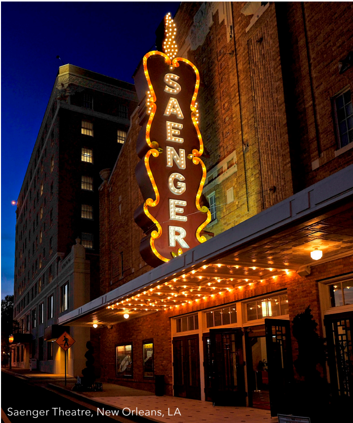
Saenger Theatre, New Orleans, LA

Due to seasonal circulation differential, the Southeast edition offers maximum discount for a nine month seasonal schedule. Check with your PLAYBILL representative to confirm performance schedules and distribution in this market.