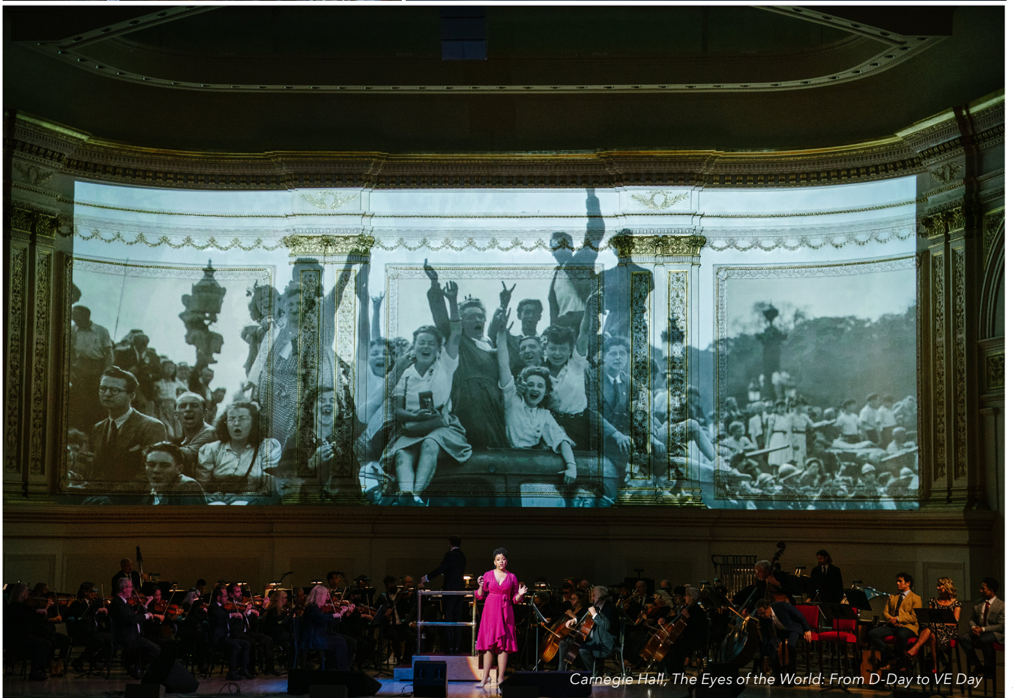
Carnegie Hall, The Eyes of the World: From D-Day to VE Day