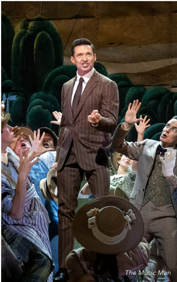
The Music Man