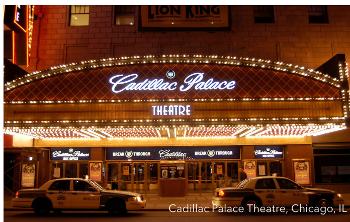
Cadillac Palace Theatre, Chicago, IL