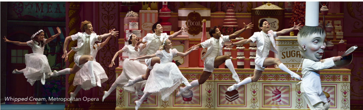
Whipped Cream, Metropolitan Opera

*In season distribution July through September each: 50% of earned rate July through September each insertion credited as 50% for frequency.