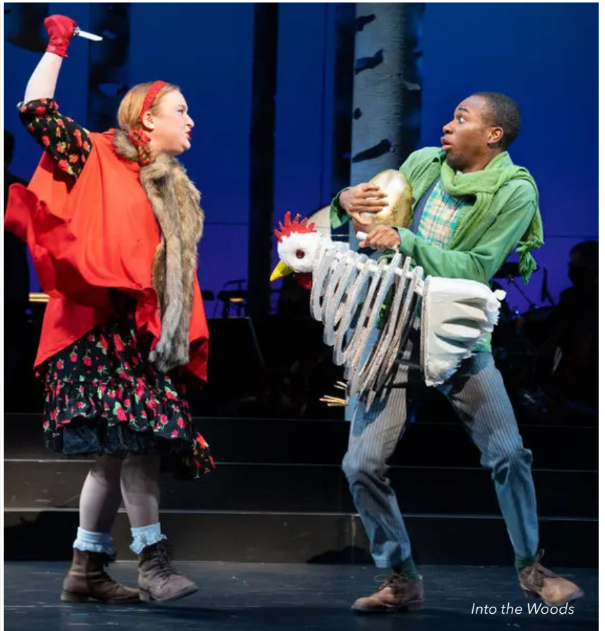
Into the Woods