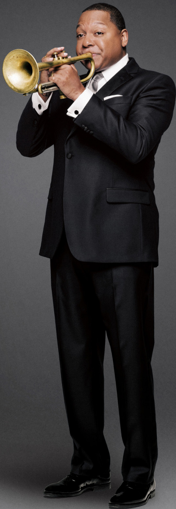
Wynton Marsalis, Jazz at Lincoln Center