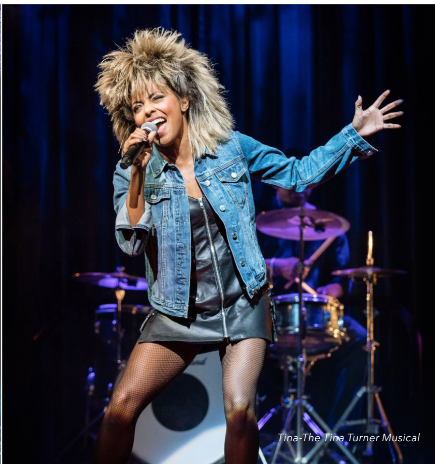
Tina-The Tina Turner Musical