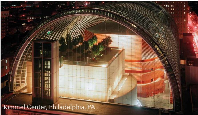
Kimmel Center, Philadelphia, PA

Check with your PLAYBILL representative to confirm performance schedules and distribution in this market.