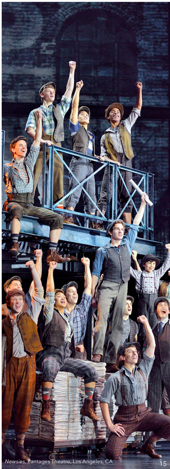
Newsies, Pantages Theatre, Los Angeles, CA