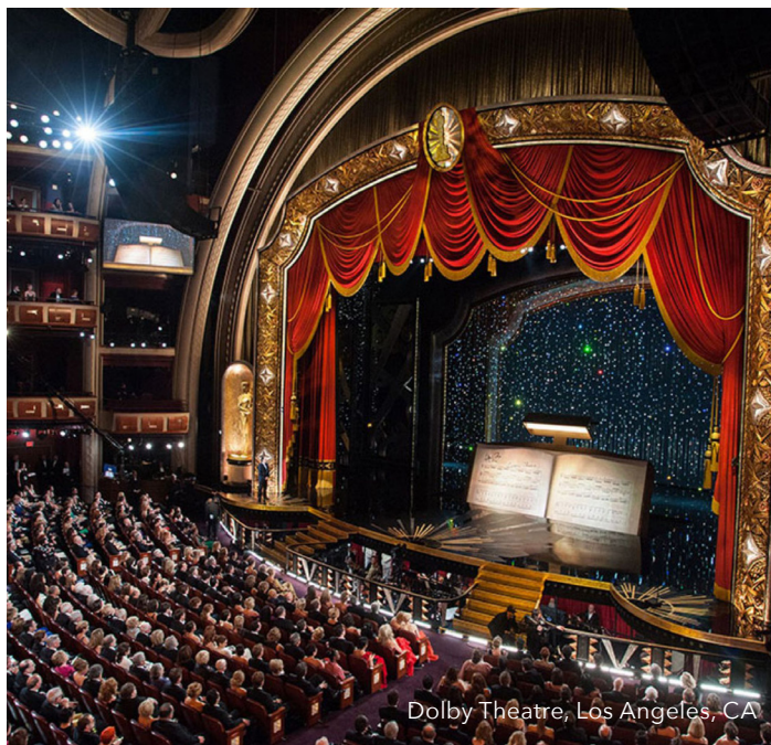
Dolby Theatre, Los Angeles, CA