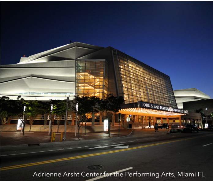
Adrienne Arsht Center for the Performing Arts, Miami FL

Check with your PLAYBILL representative to confirm performance schedules and distribution in this market.