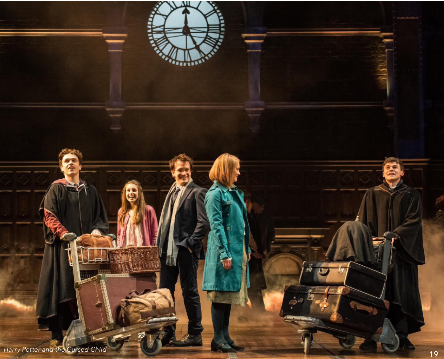
Harry Potter and the Cursed Child

PLAYBILL® is a registered trademark of Playbill Incorporated 729 Seventh Avenue, Fourth Floor, New York, NY 10019 (212) 557-5757