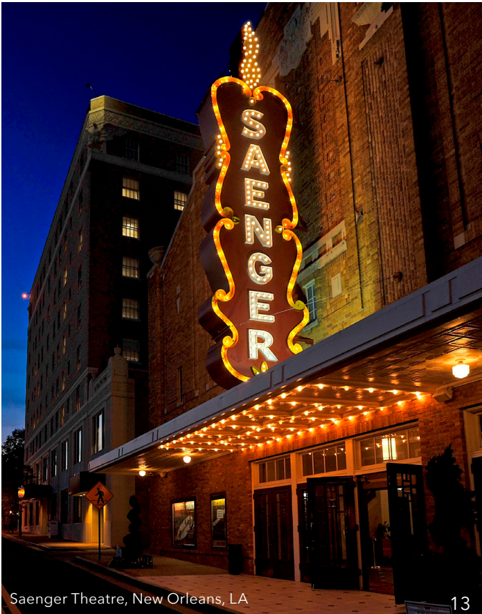
Saenger Theatre, New Orleans, LA

Due to seasonal circulation differential, the Southeast edition offers maximum discount for a nine month seasonal schedule.