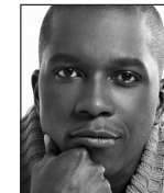
Leslie Odom, Jr.