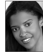
Renée Elise Goldsberry