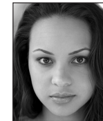
Jasmine Cephas Jones